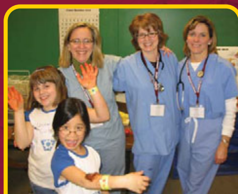
Parents, PTA members and experts from the community share their enthusiasm for STEM careers at Elementary Science Olympiad events.

Elementary Science Olympiad shows kids that science is fun, accessible and exciting, with 10,000+ elementary schools in the U.S. using Science Olympiad programs. Some hold Fun Days, where every classroom in the school becomes a hands-on science lab, or a Fun Night, where teams rotate through events staffed by local science professionals, parents and teachers. Some states even host district, regional or state competitions for grades 3-6, offering events like Animal Trackers, Don't Bug Me, Science Crime Busters, Pasta Bridge and Rock Hound. The elementary program is a great jumping-off point for Science Olympiad in the upper grades and a perfect way to enhance any school's curriculum.