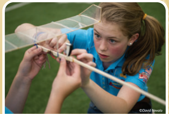
At all levels, girls represent more than half of all participants in Science Olympiad. Many have found that the teamwork aspect of Science Olympiad carries through their entire career.